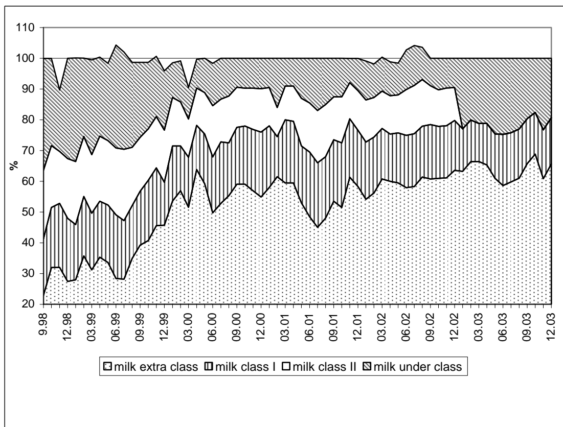
Diagram 2. Percentage of particular microbiological classes of raw milk from 1998 to 2003