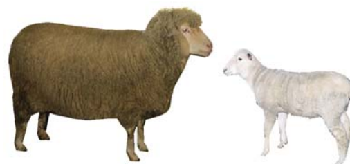
Fig. 2. Physical appearance of Mis sheep